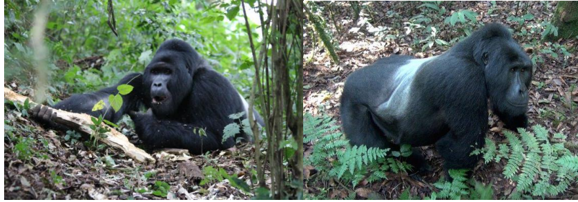
Gorillas in Bwindi