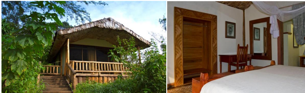
Engagi Bedroom / Cottage