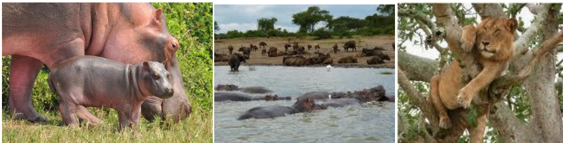
Game drive/Launch cruise

Meal plan: Breakfast and lunch and dinner