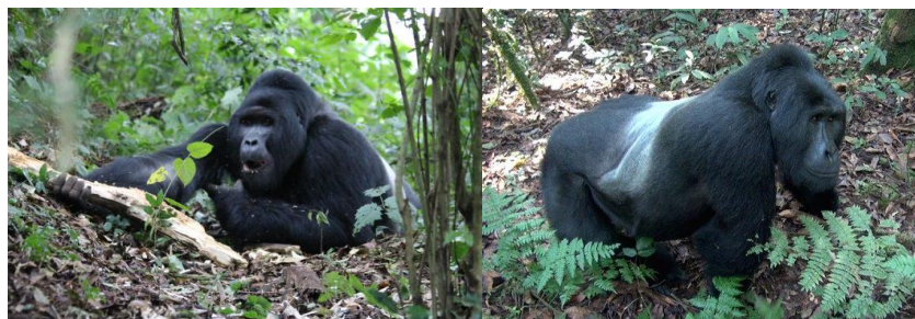
Gorillas in Bwindi